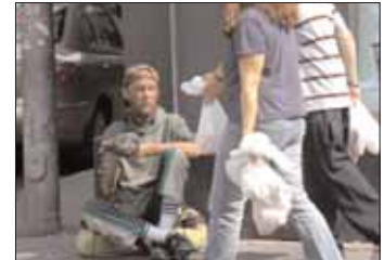
The Open Door in Pierrefonds, QC makes sandwiches every weekend to give to their neighbourhood friends.