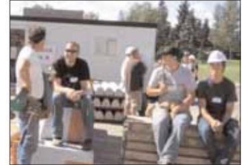
Members of West Springs Community Church in Calgary, AB build a home for Habitat for Humanity.