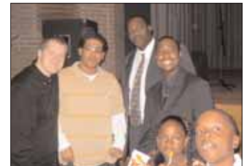
Part of the community at The Way in Scarborough, ON